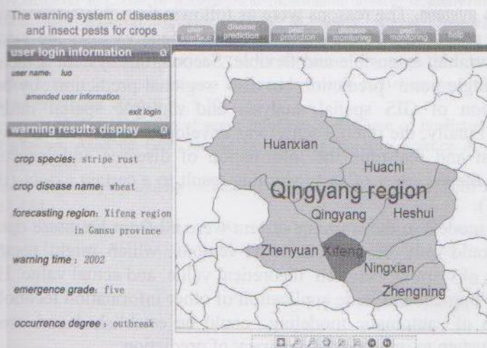
Fig.2 Pre-warning results of wheat stripe rust disease in Xifeng county of Qingyang city in 2002

By the above operation, users could call, in the model from the database of the system, and got the warning result by calculation. Finally, the pre-warning results were displayed on the right of the main interface by different color by electrical information map, at the same time, the warning results were also display by character form on the left of main interface (Fig.2).